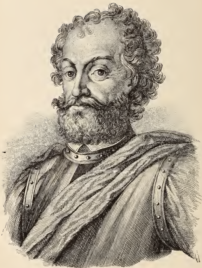
WENZEL VON BUDOWA.